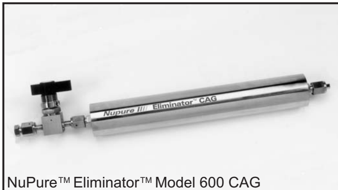
NuPure™ Eliminator™ Model 600 CAG