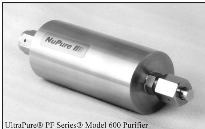
UltraPure® PF Series® Model 600 Purifier