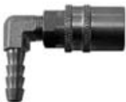
(Standard & Push-Loc Hose Barb)