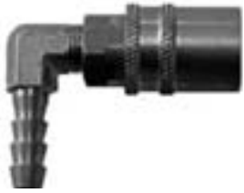
(Standard & Push-Loc Hose Barb)