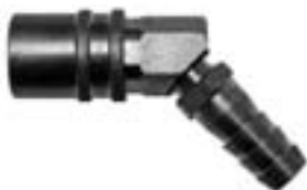
(Standard & Push-Loc Hose Barb)