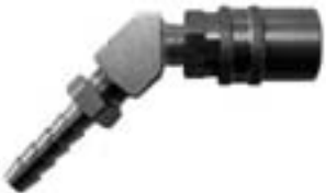
(Standard & Push-Loc Hose Barb)